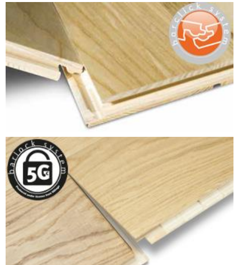
Fig. 2. Views of Barlinek floorboards with 5Gc BARLOCK and BARCLIK systems