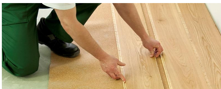
Fig. 3. The view of 3-layer wooden floorboard produced by Barlinek Invest LLC during installation

The Barlinek parquet board can be installed in a floating system, that is glueless and based on modern tongue-and-groove joints. It is a method, that allows to install the floor yourself. The floor is also easy to be dismantled or re-installed. An alternative is to install the floor in a traditional way - by gluing the boards to the subfloor, which ensures stability of the installation even on large surfaces. The Barlinek parquet board does not require any additional preservative treatment. The floor is ready for use immediately after installation. The performance of the product is listed in Table 2.