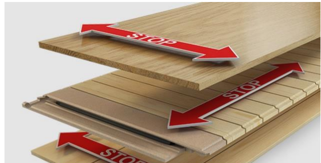
Fig. 1. Cross structure of 3-layer wooden floorboard produced by Barlinek Invest LLC

Barlinek parquet board is made from three layers of real wood arranged in a cross structure (Fig. 1) in order to prevent swelling, squeaking or drying out causing splits. The cross construction reduces natural tension and compression of wood, provides a balance between the layers of the board, and thus guarantees the stability of the floor, even under changing weather conditions outside. The Barlinek parquet board's layered structure ensures the floor's stability and is suited for underfloor heating. The parquet boards are joined using 5Gc joints and Barlik (Fig. 2) which allow to lay the floor without most of the tools which are usually necessary to install a floor. Specification of the product is shown in Table 1.